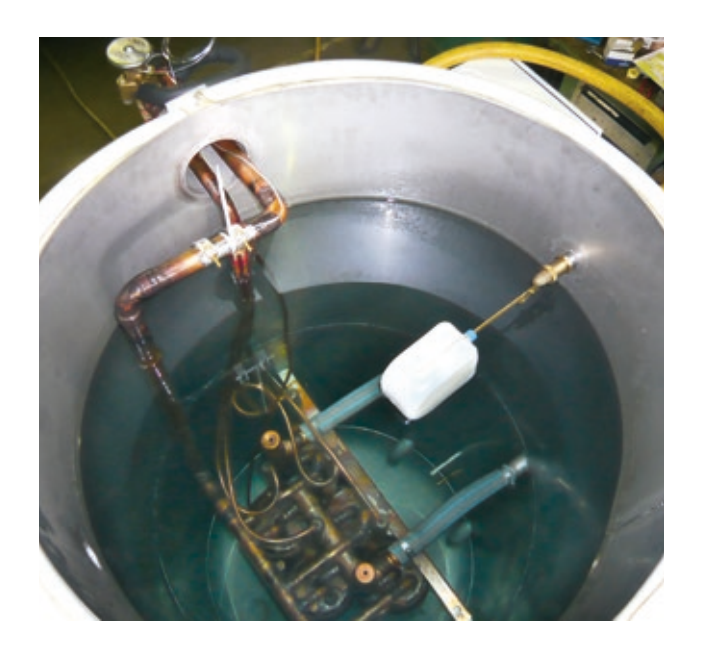
This is an open water system, which is equipped for level regulation with mechanical or electrical filling valves.

This system is also useful in the production of cooked sausage, sliced cheese and others products with deposits such as syrups, chocolate and mashed vegetables.